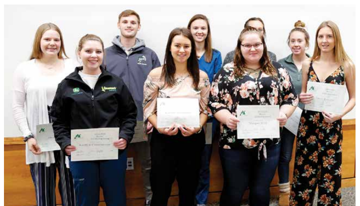
Alumni Association Scholarship