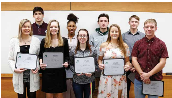
DCB Foundation Scholarship