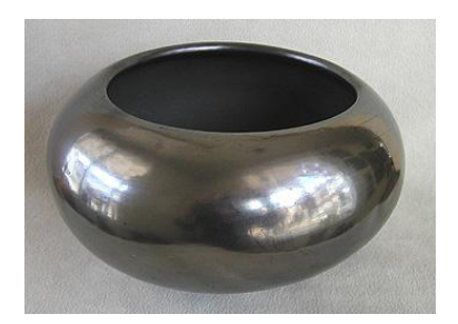
MASTERPIECE: defined as one percent inspiration and ninety-nine percent perspiration!